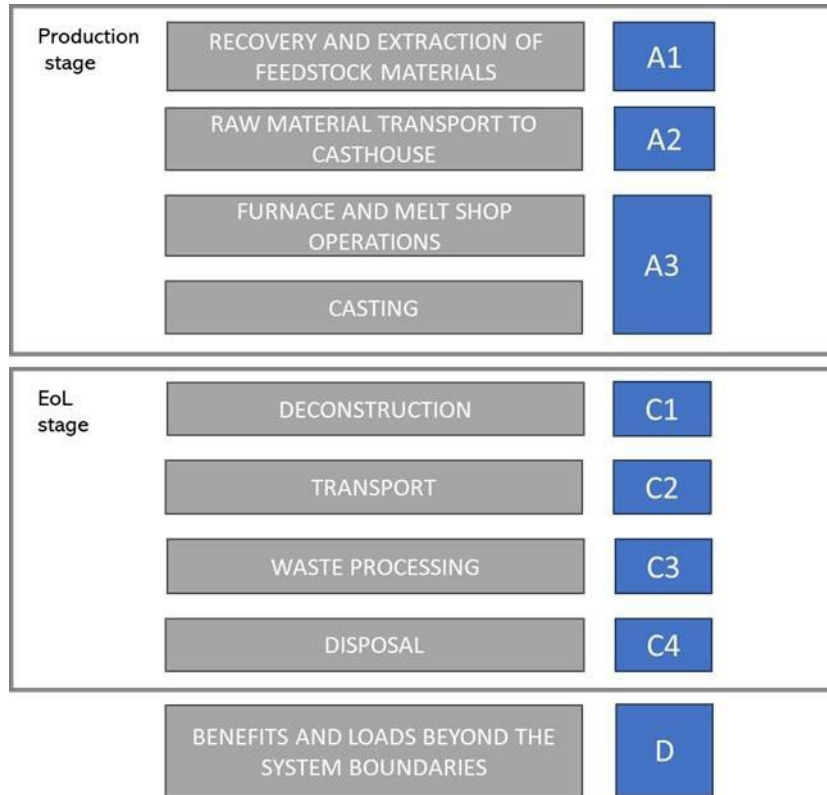
Figure 1. Scheme of the billet manufacturing process occurring at St. Augustine