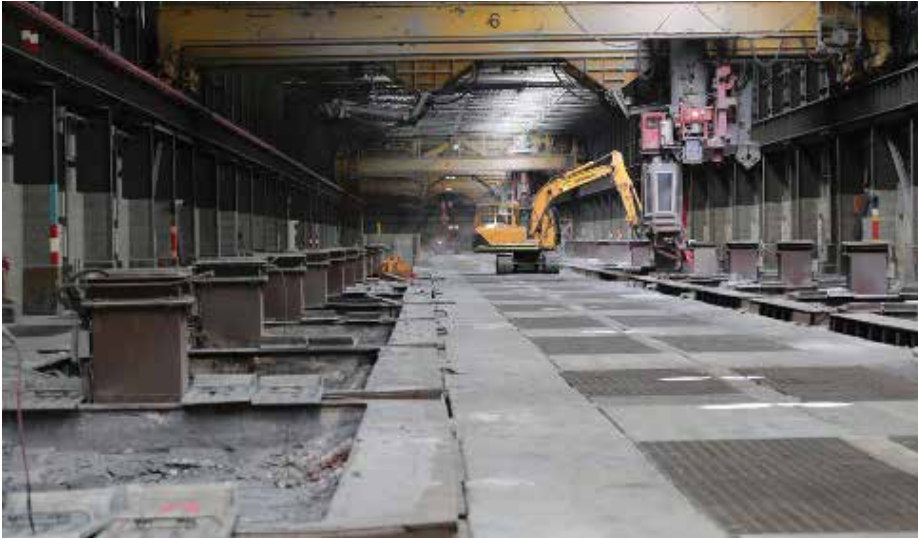
Early demolition work underway in Line 3

The demolition and remediation process is a key component of Hydro's strategic vision to increase economic activity and employment in the local area by allowing for a new generation of business and industrial development at the Kurri Kurri site.