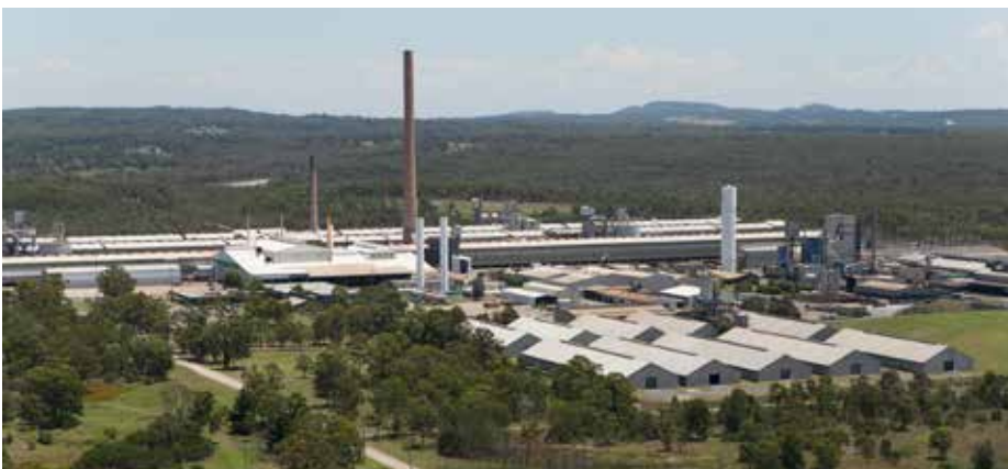
The stacks in this photograph will be demolished as part of Stage 2 demolition, and require an environmental impact statement.

Our community reference group (CRG) was established with the purpose of bringing community input to the project, and was involved in the development of criteria to be used in shortlisting potential recyclers of the spent pot lining. Discussions about this are recorded in meeting minutes which are available to view on our website. While this recycling process is separate to the remediation of the site, Hydro wished to involve the community in the selection of the spent pot lining recycling process. Hydro is currently undertaking a series of investigations with potential recyclers.